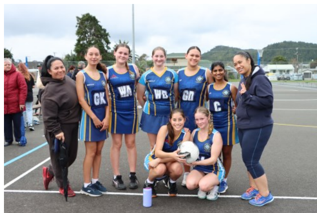
Netball Collegiate Team 2