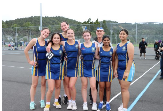
Netball Collegiate Team 1

Sam Page SPORTS CO-ORDINATOR 438 3950 Ext 219 sports@pompallier.school.nz